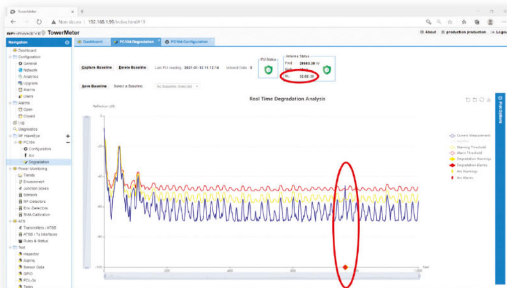
VSWR/RL Degradation Chart

In general, all the mentioned systems share a common limitation: they are reactive i.e. a significant degradation has already occurred before the monitoring system provides an indication of the problem. Systems relying on arc detection will likely miss the small degradations in components or connections that have to occur before an arc develops. In other words, the arc is not an early